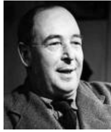
C. S Lewis

A number of highly intelligent people have navigated the gulf between atheism and reasonable belief, among them C. S Lewis.